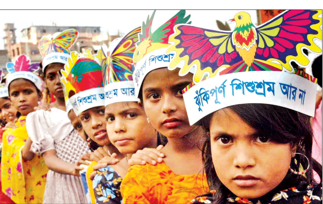
Children take out a procession organised by Dhaka Ahsania Mission and Resource Integration Centre at Kamrangir Char in the capital yesterday, demanding an end to child labour.

Without consulting the teachers, students, guardians, researchers and educationists, the education ministry has taken the initiative to make the change in SEE PAGE 15 COL 6