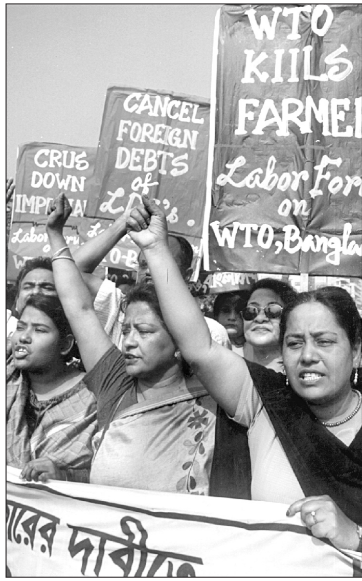
The Labour Forum on WTO, Bangladesh stages a demonstration at Mukhtang in the city yesterday to protest free trade policies ahead of the WTO ministerial conference, which is scheduled to begin in Hong Kong on December 13.