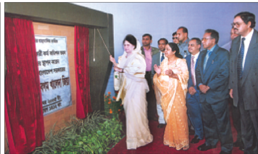
Prime Minister Khaleda Zia lays the foundation stone of the new building for the Public Service Commission in Agargaon in the city yesterday.