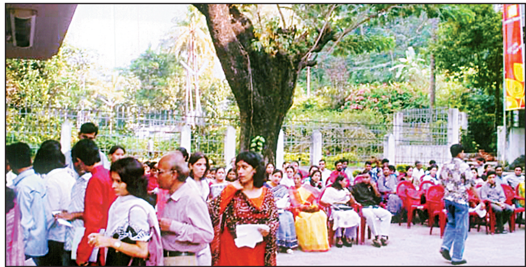
Bengal Foundation has embarked on the second round of its talent hunt, Bengal Bikash. The regional selection of Chittagong zone began recently at the Chittagong Theatre Institute. Aspiring singers, their parents, relatives and friends throng the audition premises in the photograph.

In his message, Malta's President Dr Edward Fenech-Adami says: "Music is certainly a means of communication, a universal language, and is indeed a dynamic and unifying force that has the power to overcome all social and economic confines."