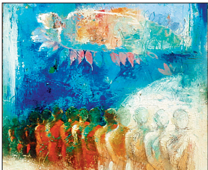
In quest of truth

Her Dream of Mahamaya , seen in this exhibit, depicts her mixed-media work, with her nonpareil lyricism. There is a lady reposing on a chariot, with her dream of a child symbolised by a baby elephant. We see this held on in a bar of ochre, with twirling, gliding leaves and tendrils, and