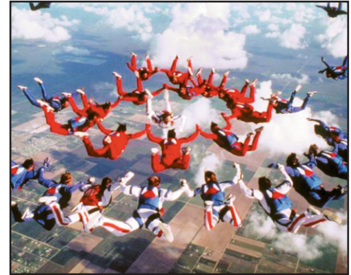
Drop Zone On HBO at 9:30 pm Genre: Action/Adventure Cast: Wesley Snipes, Gary Busey

01:45 Dare 03:25 Good Girl The 05:00 Rik 07:00 Mystery Men 08:45 Species 10:15 Species 2 12:25 Die Another Day 01:30 Cube 2: Hypercube STAR WORLD 10:30 Monk 11:30 Enterprise 12:30 Parkinson 01:30 The A Team 02:30 Oprah Winfrey Show 03:30 Bold And Beautiful 04:30 Hollywood Squares 05:00 Whose Line Is It Anyway 05:30 Buffy The Vampire