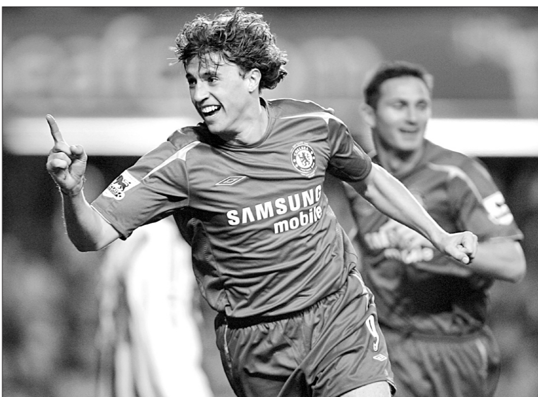
Chelsea's Hernan Crespo in raptures after scoring a goal against Premiership opponents Newcastle at Stamford Bridge on Saturday.

Lyon humbled Real 3-0 back in September and a similar result in front of an unforgiving Bernabeu would crank up the pressure on Real coach Vanderlei Luxemburgo.