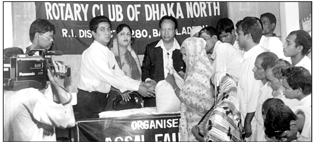
The Rotary Club of Dhaka North distributes relief materials among Monga-affected people at Teesta's Char in Rangpur recently.