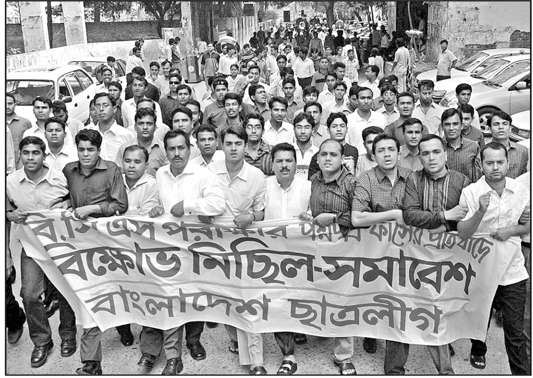
Leaders and activists of Bangladesh Chhatra League march in a procession on Dhaka University campus yesterday protesting the leak of questions of the 27th Bangladesh Civil Service (BCS) preliminary test.

The law promises accountability and transparency to climb up several notches, especially as it provides for hefty fines and disciplinary action against erring officials. The general superintendence, direction and management of the affairs of the Central Information Commission shall vest with the Chief Information Commissioner, who shall be assisted by the information commissioners, and may exercise vast powers autonomously without being subjected to directions by any other authority.