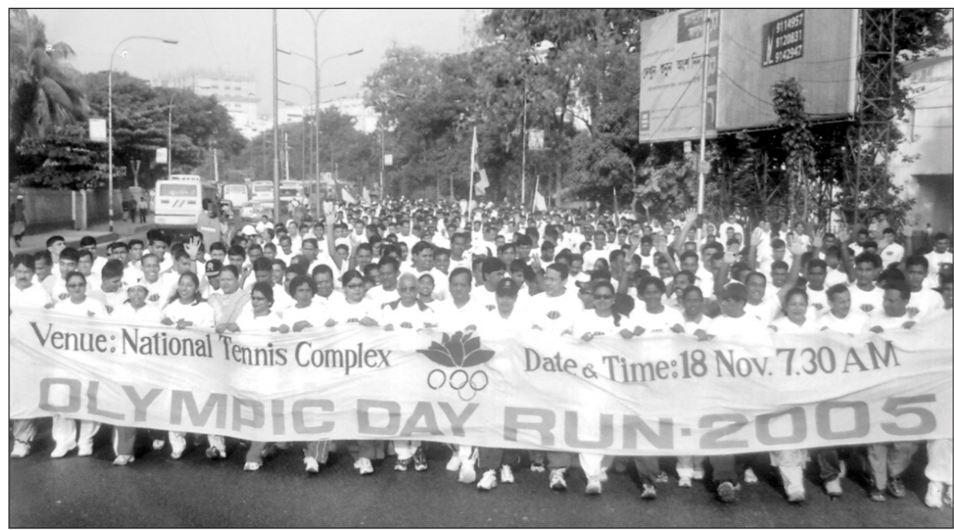
Participants of the Olympic Day Run in the city on Friday.