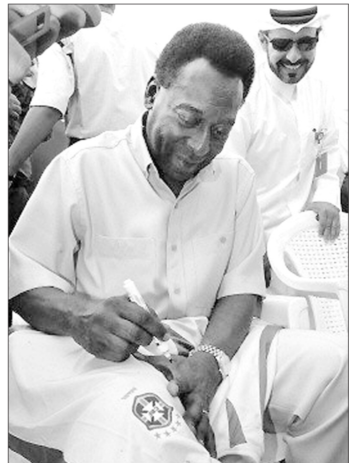
Pele signs an official Brazil jersey during his visit to Qatar where he opened the Aspire football academy in Doha on Thursday.

individual players. There is no doubt about that," he said. "But it is not always the favourites with the best players that win."