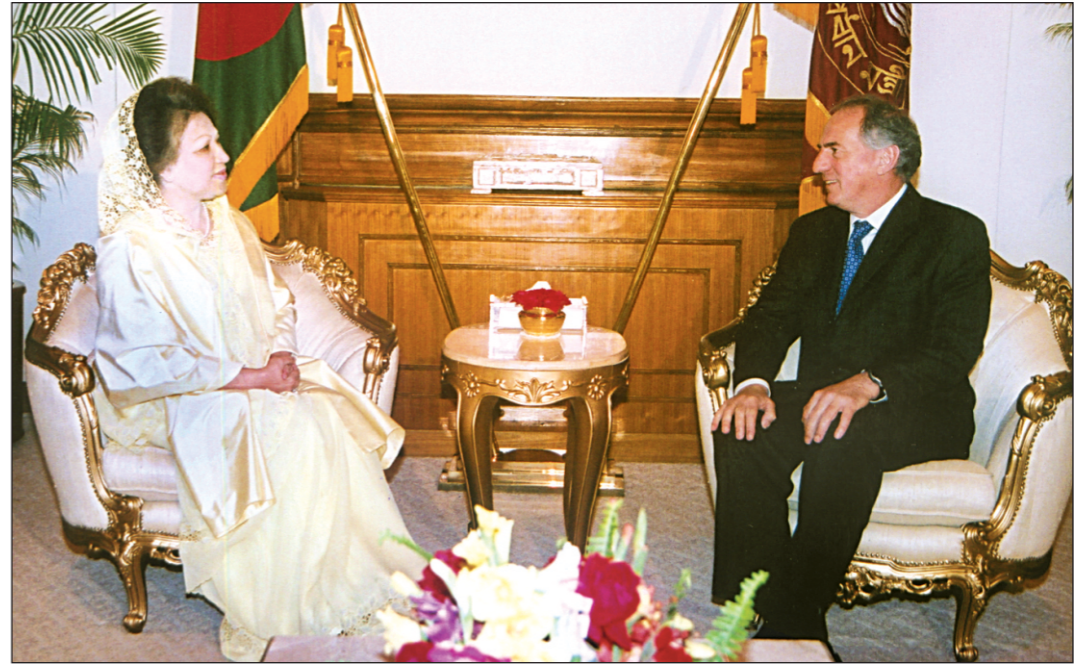
Visiting UK Minister of State for Foreign and Commonwealth Affairs Kim Howells meets Prime Minister Khaleda Zia at her office yesterday.

STAFF CORRESPONDENT, Sylhet Sylhet kotwali police could not extract any significant information from the suspected JMB cadre Obayed Prodhania during the 4-day remand, which ended yesterday.