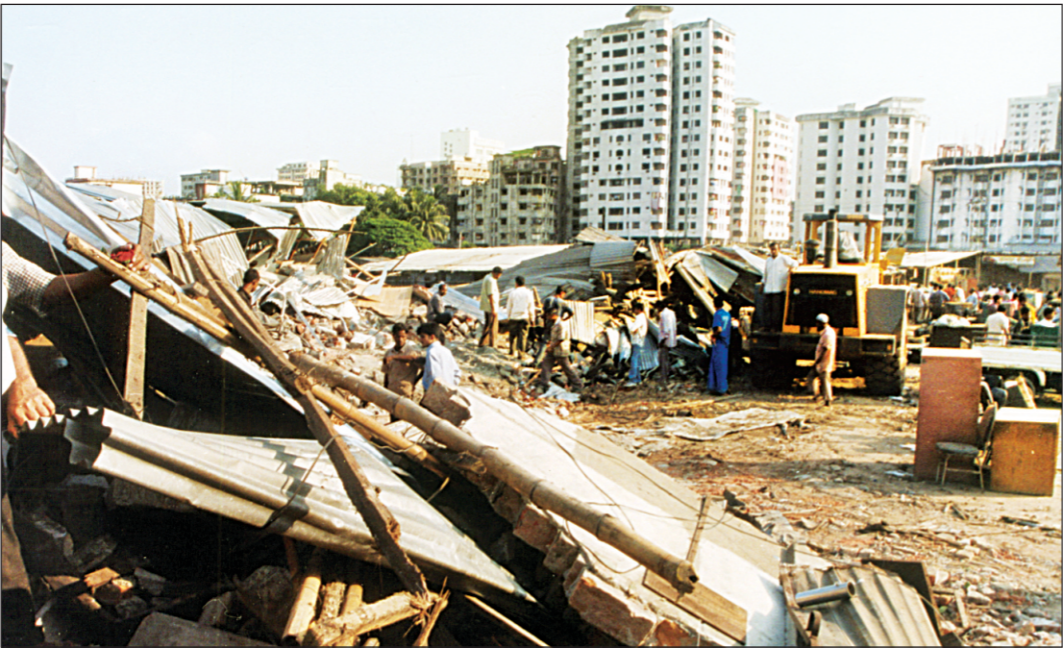
An eviction squad of Dhaka City Corporation demolishes a number of illegal structures adjacent to the Sonargaon Hotel yesterday.