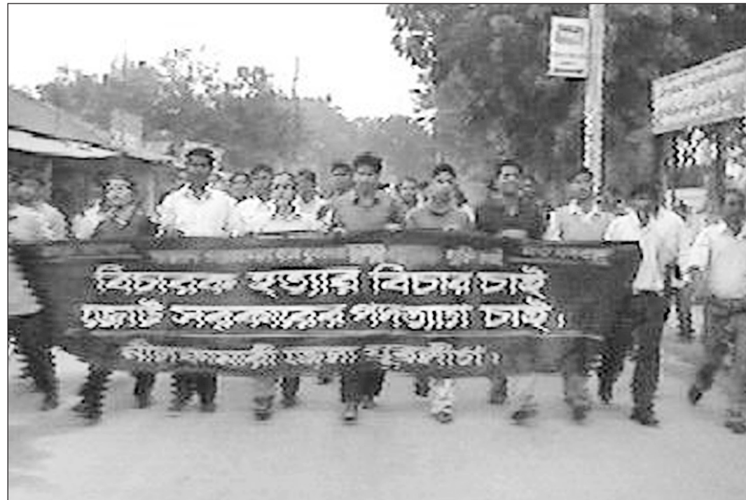
Awami Jubo League, youth front of opposition Awami League, brought out a procession in Nilphamari town yesterday protesting the killing of two judges in Jhalakathi by a JMB suicide bomber on Monday.