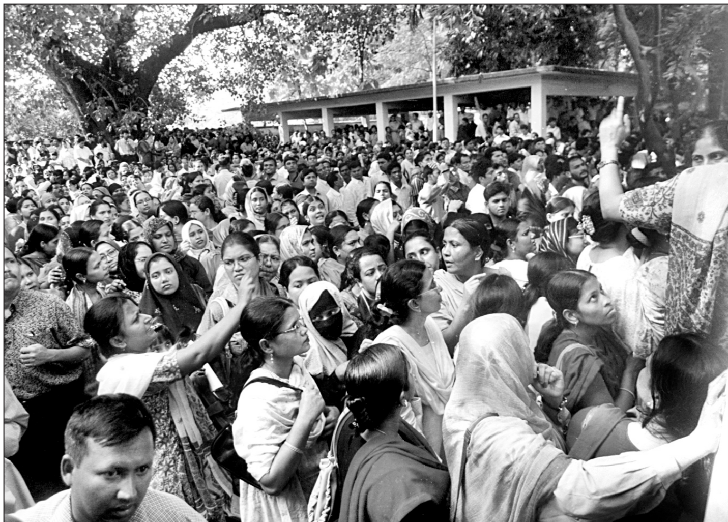
A large number of guardians through the Viqarunnisa Noon School and College in the city yesterday to buy application forms for admission tests for their children.

The government gave the appointment through a notification of Youth and Sports Ministry, an official handout said yesterday.