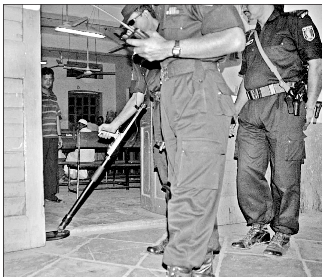
Members of Rapid Action Battalion run a metal detector in a room of the Judge Court in the city yesterday as part of beefed-up security following the killing of two judges in Jhalakathi.

On the occasion, a doa mahfil will be held at her residence.