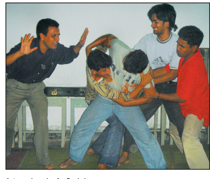
Actors rehearsing for Baghal