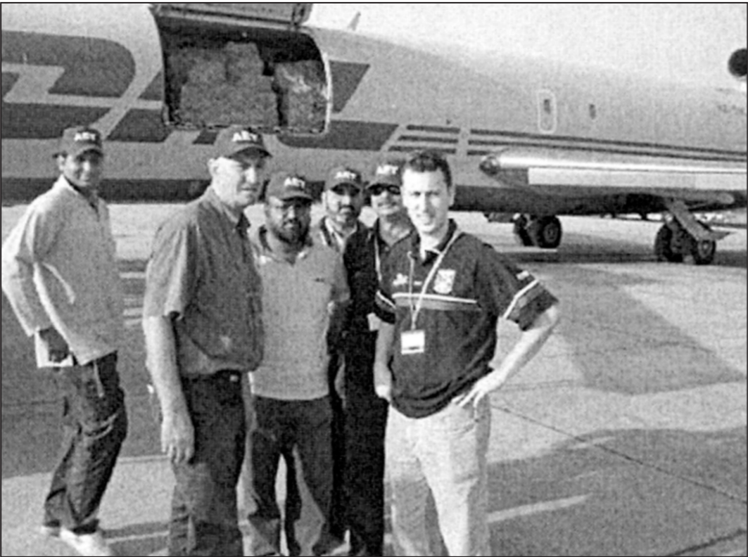
Several members of the Airport Emergency Team prepare to unload a DHL aircraft full of relief aid.

The court awarded the penalty for over-loading, illegal movement of vessels in and around the port area, operating vessels without radio and required manpower.