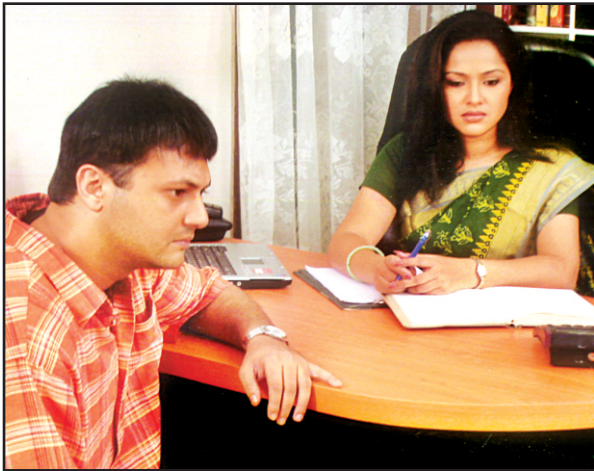
A scene from the serial

The main characters in the TV serial are played by Bulbul Ahmed, Dilara Zaman, Zahid Hassan, Joya Ahsan, Litu Anam, Rumana, Shimu, Dipa Khandakar, Shahed and Nadia.