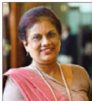
CHANDRIKA BANDARANAIKE KUMARATUNGA President, Sri Lanka

President Chandrika Bandaranaike Kumaratunga was born to one of Sri Lanka's most distinguished families on June 29 in 1945. Her father, SWRD Bandaranaike, was a senior Minister of the government at the time of her birth. He was later to become the Prime Minister of the country, while her mother, Sirimavo Bandaranaike, was to become the world's first woman Prime Minister in 1961.