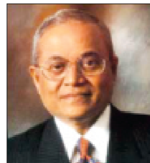
MAUMOON ABDUL GAYOOM President, Maldives

President Maumoon Abdul Gayoom is, in both origin and style, very much a man of the people. He has been the president of the Republic of Maldives since November 11, 1978, having succeeded Ibrahim Nasir.