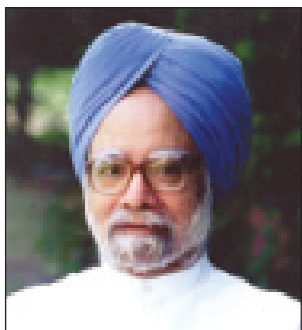
MANMOHAN SINGH Prime minister, India

India's fourteenth Prime Minister, Dr Manmohan Singh is rightly acclaimed as a thinker and a scholar. He is well regarded for his diligence and his academic approach to work, as well as his accessibility and his unassuming demeanour.