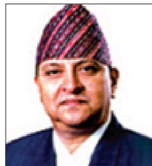
GYANENDRA BIR BIKRAM SHAH DEV King, Nepal

King Gyanendra Bir Bikram Shah Dev of Nepal was born on July 7 in 1947 Kathmandu, has been the King of Nepal since June 2001. King Gyanendra is son of His late Majesty King Mahendra Bir Bikram Shah and Her late Royal Highness Crown Princess Indra Rajya Laxmi Devi Shah.