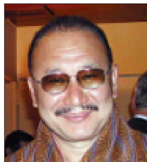
LYONPO SANGAY NGEDUP Prime minister, Bhutan

Lyonpo Sangay Ngedup is Prime Minister and Minister of Agriculture in Bhutan. In Dzongkha word Lyonpo means "Minister".