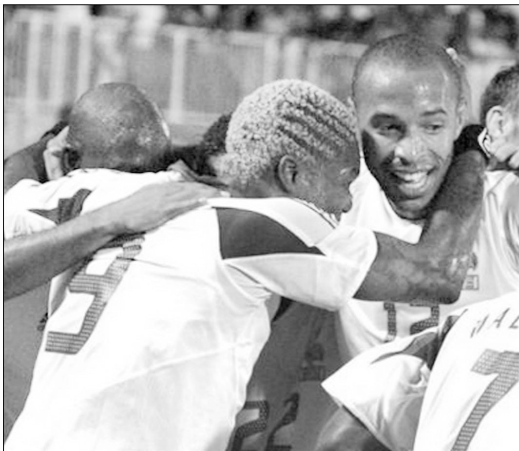
France's ace striker Thierry Henry (R) is congratulated by teammates after scoring the winner against Costa Rica during a friendly match at the Dillon Stadium in Fort-de-France, Martinique on Wednesday. France won 3-2.

Last month, the Supreme Court had helped the principal disputants arrive at a consensus on a six-point terms of reference.