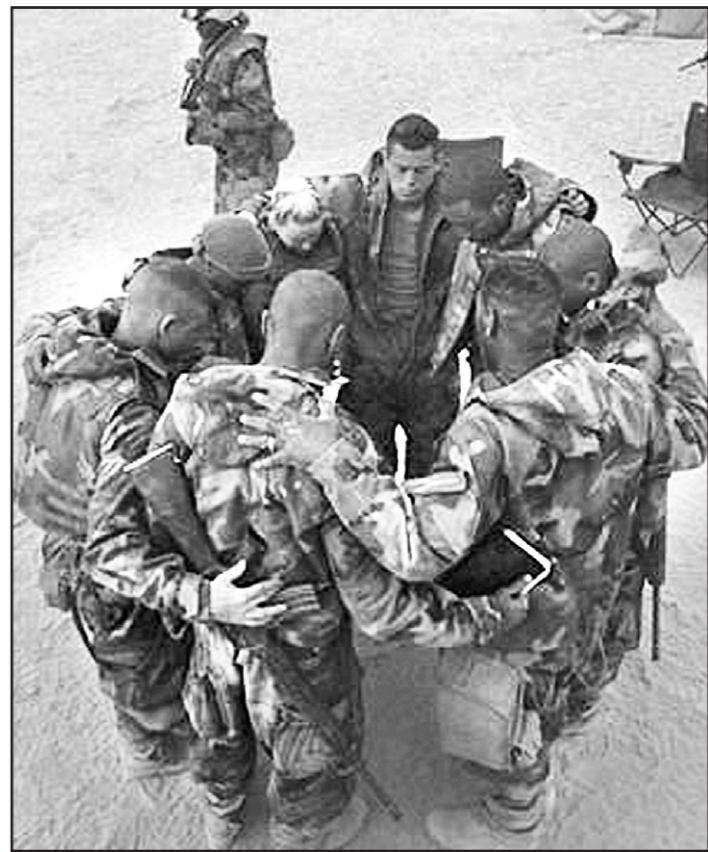
US soldiers in Iraq

All text is verbatim from senior Bush administration officials and advisers. In places, tenses have been changed for clarity.