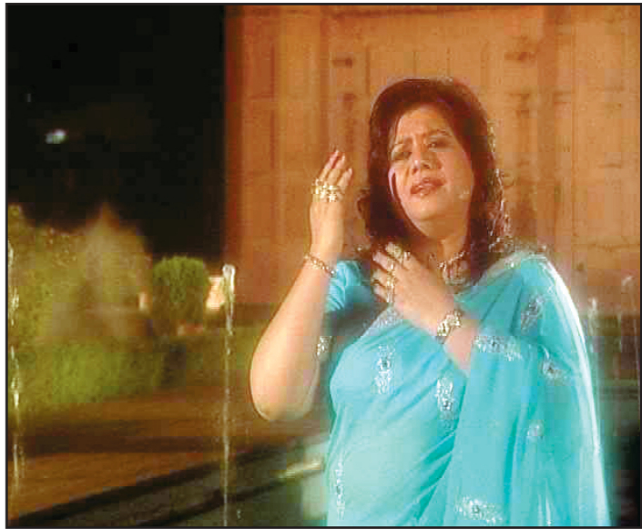
Runa Laila in Geeti Modhumoy

A special documentary on Maldives will be telecast at 04:25pm on November 10, while a documentary on Nepal will be aired at 04:25pm on November 11. Likewise Pakistan will be in the spotlight at 04:25pm on November 12, Sri Lanka at 04:25pm and Bangladesh