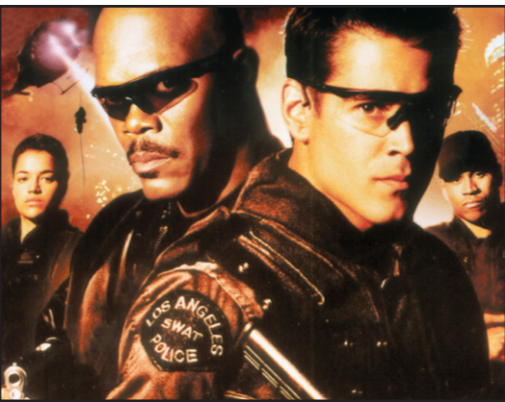
S.W.A.T. On HBO at 09:30pm Genre: Action/Thriller Cast: Samuel L. Jackson, Colin Farrell, Michelle Rodriguez

6:00 Sms A Flick 8:40 Hope Floats 10:55 One Fine Day STAR PLUS 11:30 Shanti 12:25 Film Topper 12:30 Hit Filmeln Hit Sangeet 12:55 Taaza Hits 2:00 Bhabhi 2:30 Kesar 3:00 Saarthi 5:00 Piya Bina 6:00 Zindagi Milke Bitayenge 7:30 Talesp 9:00 Kim Possible 7:30 Kumkum - Pyara Sa Bandhan 8:00 Akkad Bakkad Bambeay Bo 8:30 Mum Tum Aur Hum 9:00 Kasauti Zindagi Kay Milie 9:30 Kavayanjali 10:00 Kahaani Ghar Ghar Kii 10:30 Kyunki Saas Bhi Kabhi Bahu Thi STAR WORLD 10:30 Smallville 11:30 Medical Investigations 12:30 Life As We Know It 1:30 The A Team 2:30 Oprah Winfrey Show 4:30 Hollywood Squares 5:00 Whose Line Is It