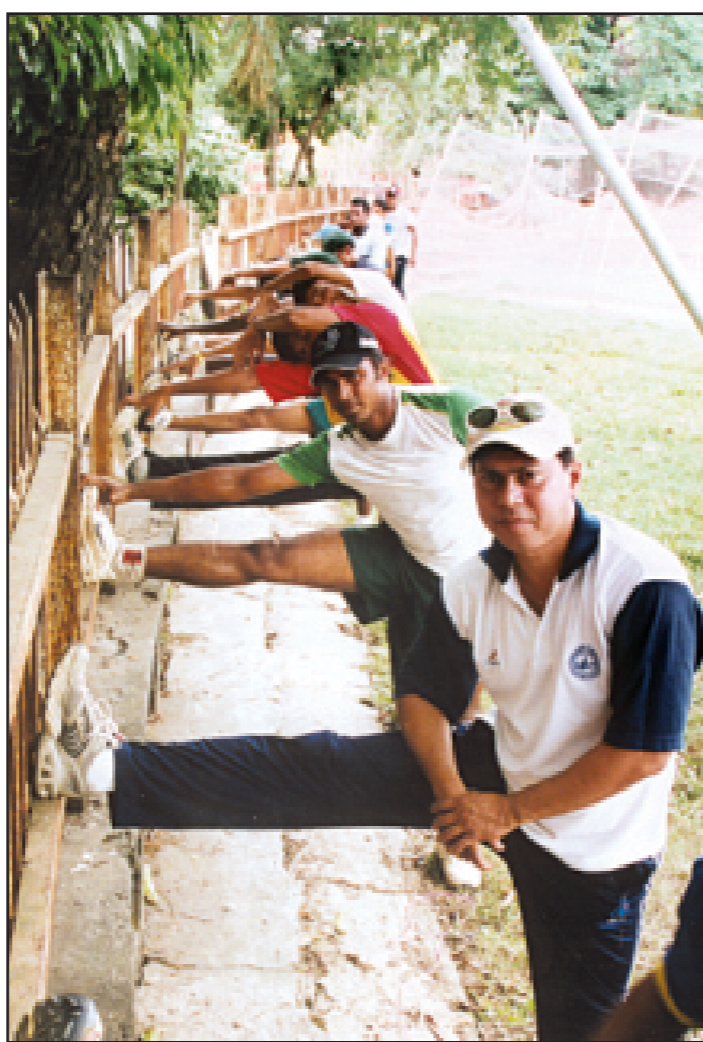
Members of the MM Ispahani team do some stretching as part of their training at the Dhanmondi Club ground on Tuesday.

The CCL, which was supposed to be completed in October, suffered an unscheduled break because of rain interventions. It also upset the whole domestic calendar pushing the National League and the Premier Division League for delayed starts.