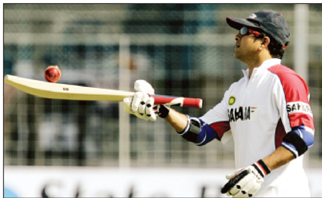
India superstar Sachin Tendulkar balances a ball on his bat during a practice session at Rajkot on Tuesday.