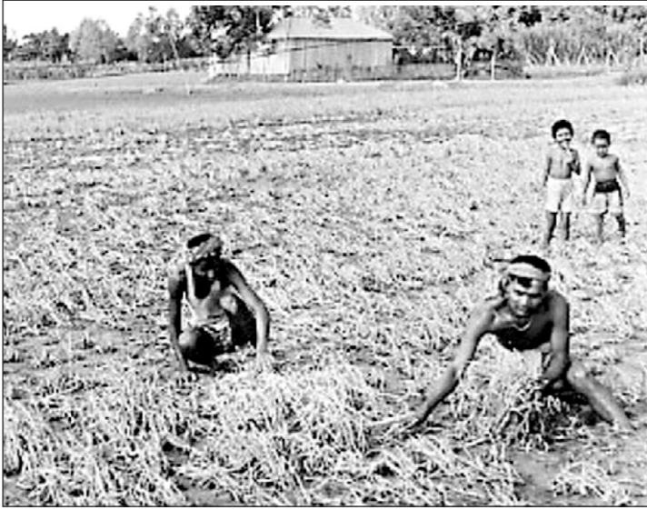
Two farmers at Khalshai village in Gobindagnaj cutting damaged aman plants for use as fodder (left) and a flood-devastated banana garden.