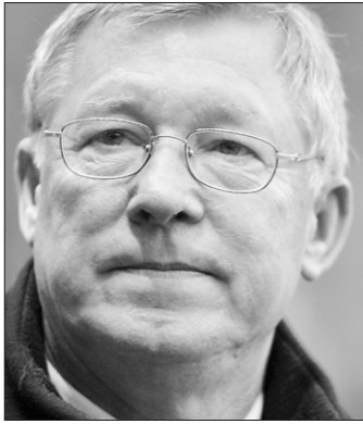
SIR ALEX FERGUSON

"For an hour against Chelsea we were terrific, but we were under the cosh for the last ten minutes because they went for everything, but that's what champions do."