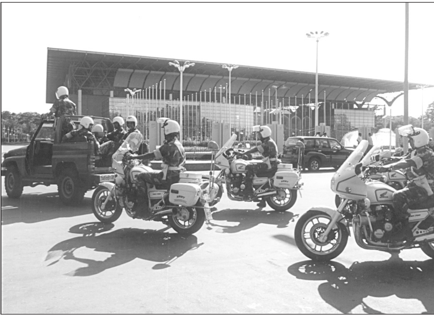
The SSF members who will escort the Saarc leaders during the summit enter the complex of Bangladesh-China Friendship Conference Centre during their rehearsal yesterday.

He was admitted to the Military Hospital there following complaints of breathlessness four days ago.