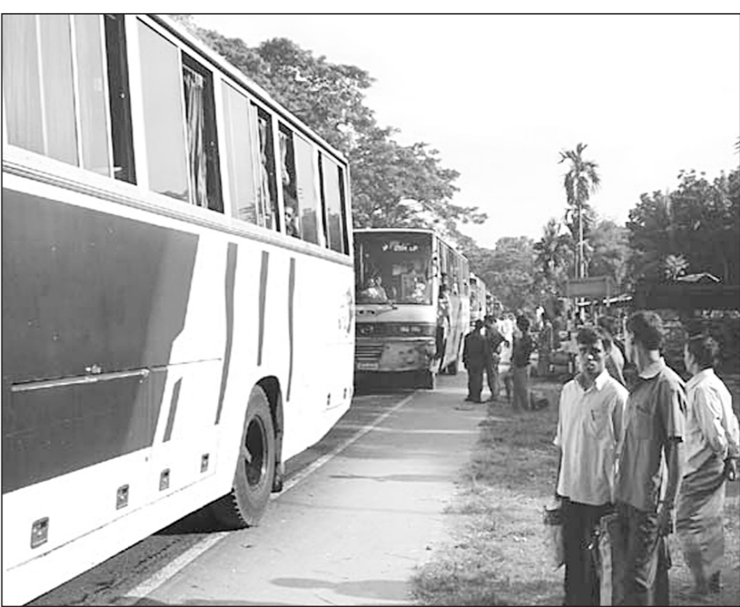
Buses remain stranded at Babuganj on Dhaka-Barisal highway as angry mob put up a barricade on the road after an accident yesterday.