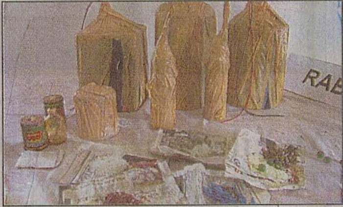
The bombs and bomb-making materials seized by Rapid Action Battalion in Bandarban and Cox's Bazar yesterday.

The seized materials include one kilogram RDX (royal demolition explosives) white powder, 500