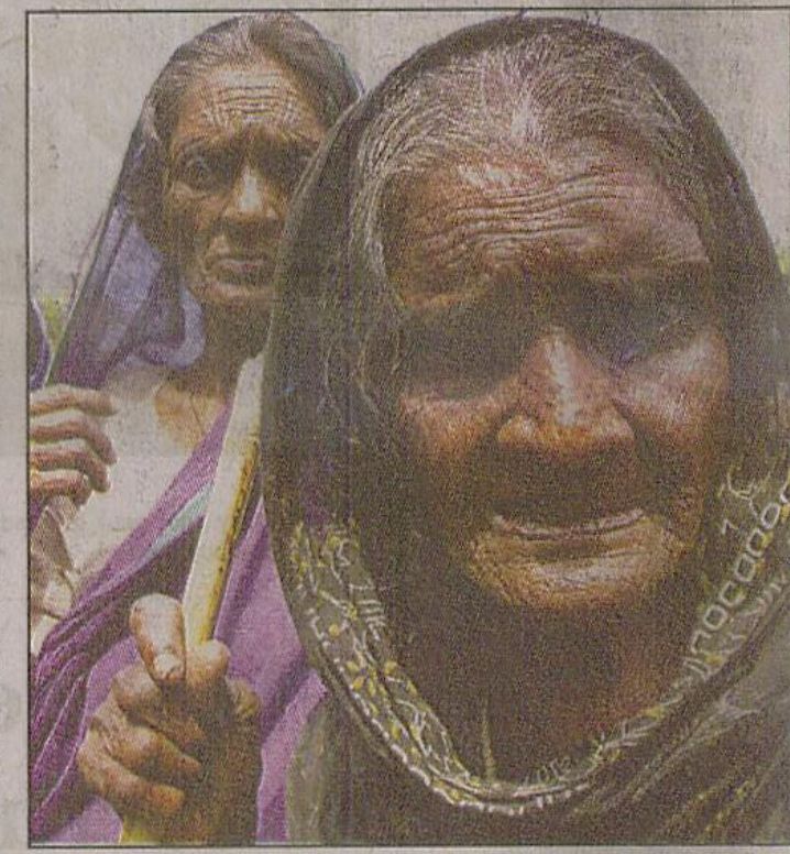
FACES OF MONGA: Hunger forces these two elderly women to beg for food in Kurigram town while the nation prepares for Eid celebrations.