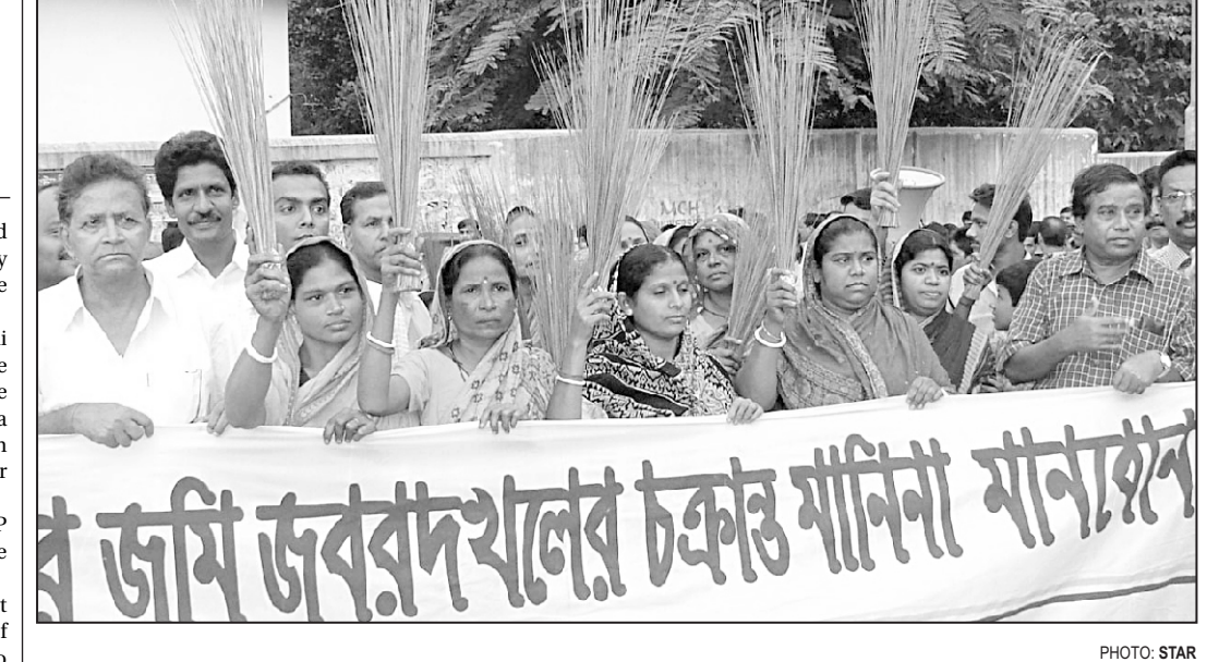
The Hindu Bouddha Christian Oikkya Parishad brought out a broom procession in Chittagong on Friday protesting alleged grabbing of land of a minority community member in the city by the City Corporation.

Ershad said the flood affected people in the monga-hit areas in northern districts are passing days without food but the government seems indifferent to the situation.