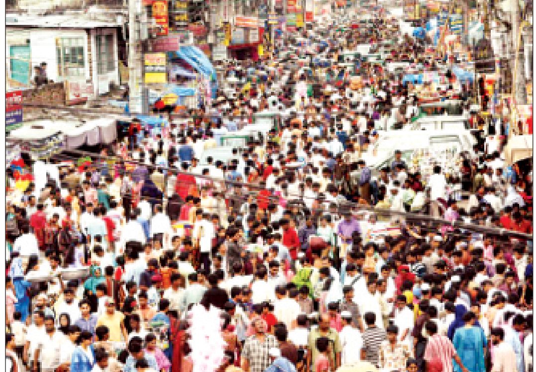
The road beside the Gausia market in the city gets overcrowded, mostly with shoppers, just a week ahead of the Eidul-Fitr yesterday.

Nawimi reiterated that his client SEE PAGE 15 COL 8