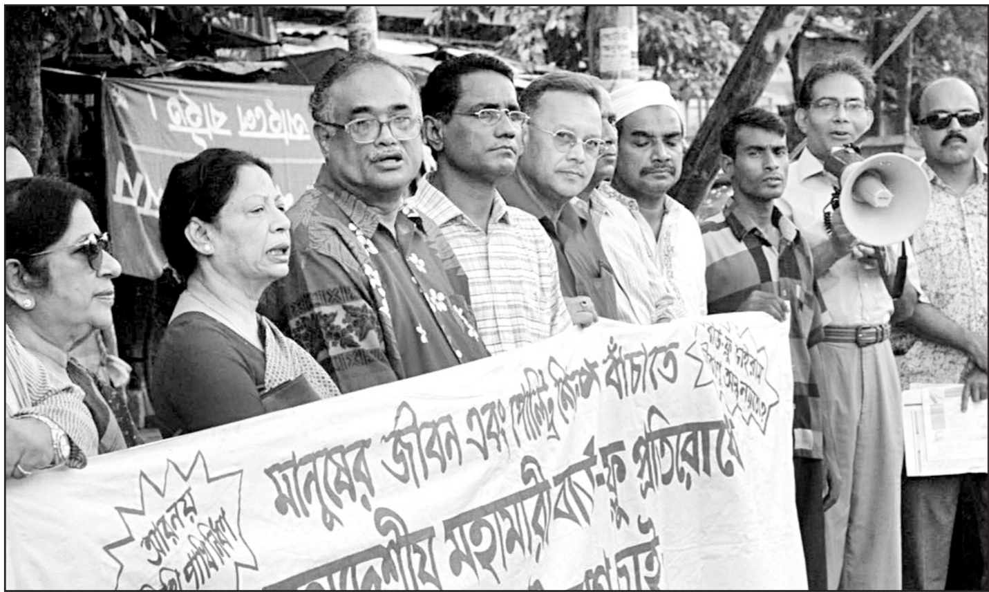
Paribesh Bachao Andolon (Save the Environment Movement) forms a human chain at Shahbagh in the city yesterday demanding coordinated efforts to prevent a bird flu pandemic to save lives and poultry industry.