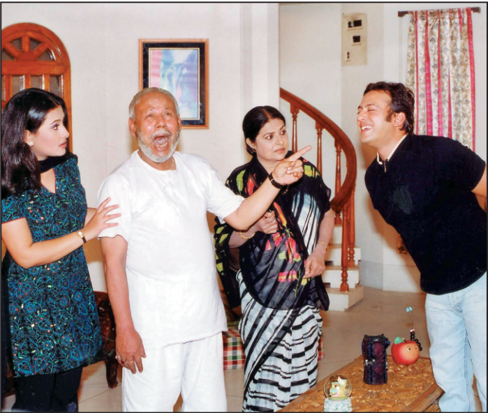
A lighter scene from Tak Jhaal Mishti