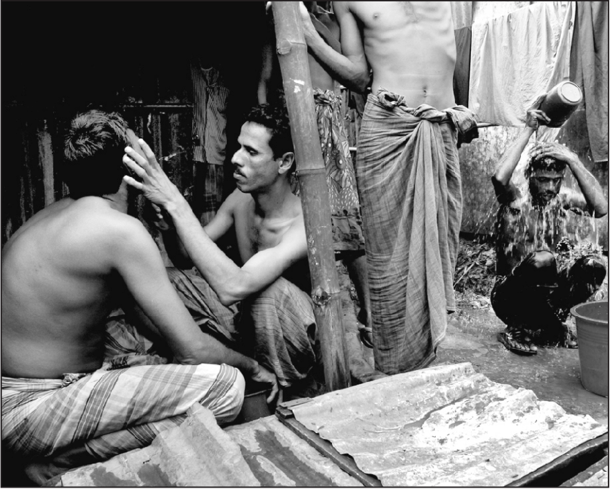
Some images taken from the projects that formed the workshop