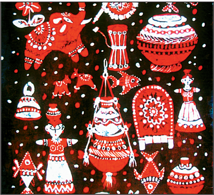
A colourful work in batik (Top), a creation in applique (Bottom)