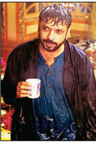
Sanjay Leela Bhansali

The film will be called Saawariya. While no details of the cast and story have yet been declared, one assumes this is likely to be the director's already announced next project, starring Rishi Kapoor's son, Ranbir, and Anil Kapoor's daughter, Sonam.