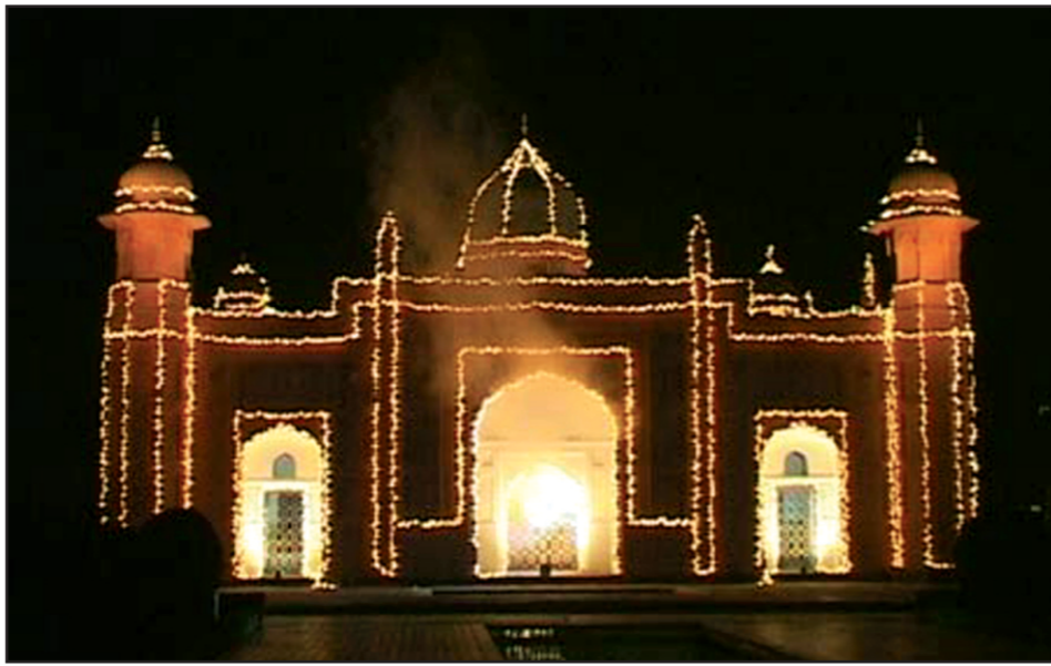
An illuminated Pari-Bibi's mazar at the Lal Bagh Fort