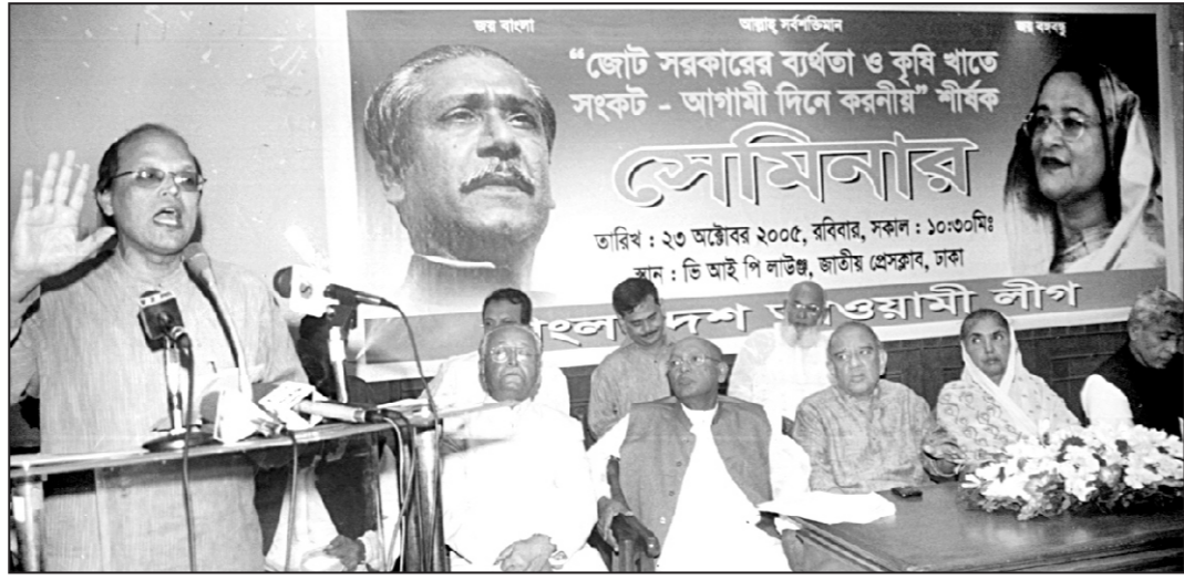
Economist Dr Atiur Rahman speaks at a seminar titled 'Crisis in agricultural sector and failures of the alliance government: Future directives' at the National Press Club in the city yesterday.

"Looting is going on in the name of subsidy," he said, adding that the alliance government has no control over market.