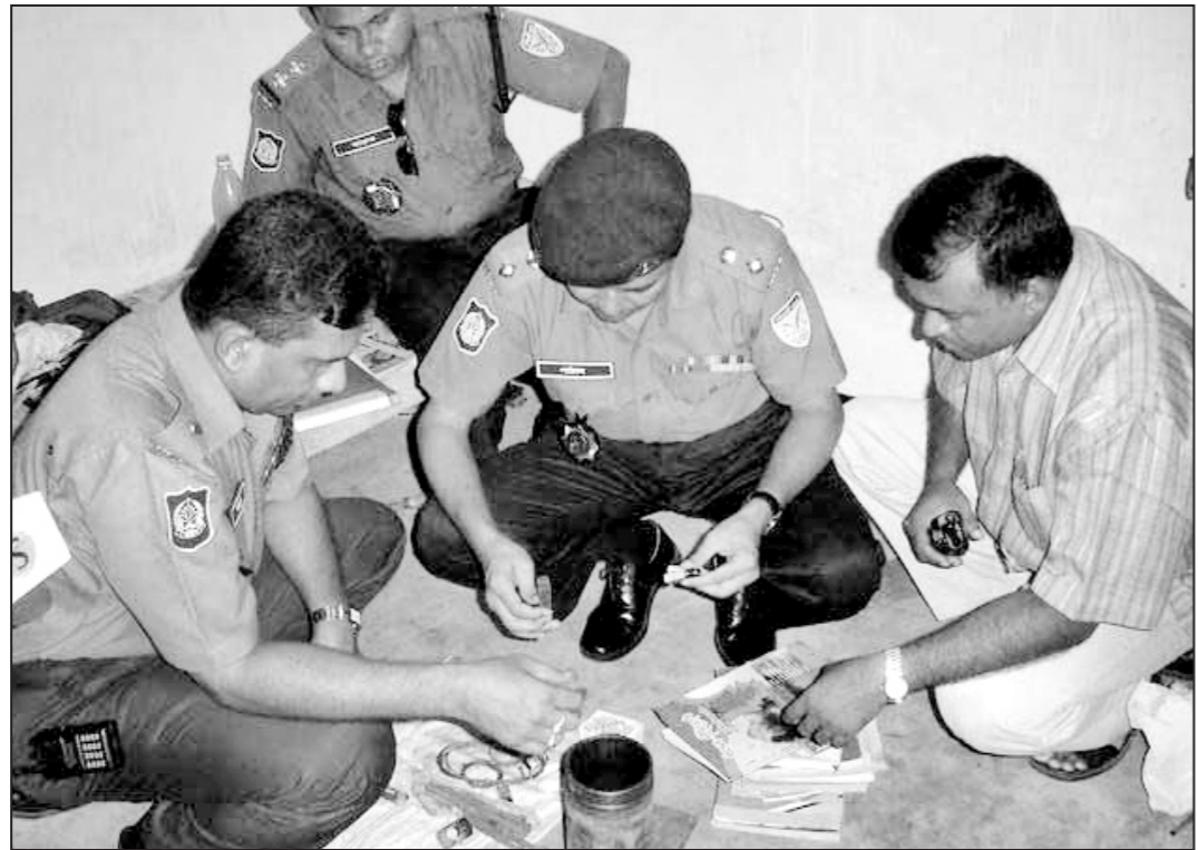
Police officials inspect bomb-making materials and Jihad books seized from the rest house of Bhangatikor Jame Masjid at Sheikhghat in Sylhet yesterday. (Story on Page 1)