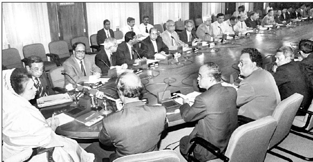
Prime Minister Khaleda Zia holds a meeting with the secretaries of different ministries at the Cabinet Division conference room in the city yesterday.