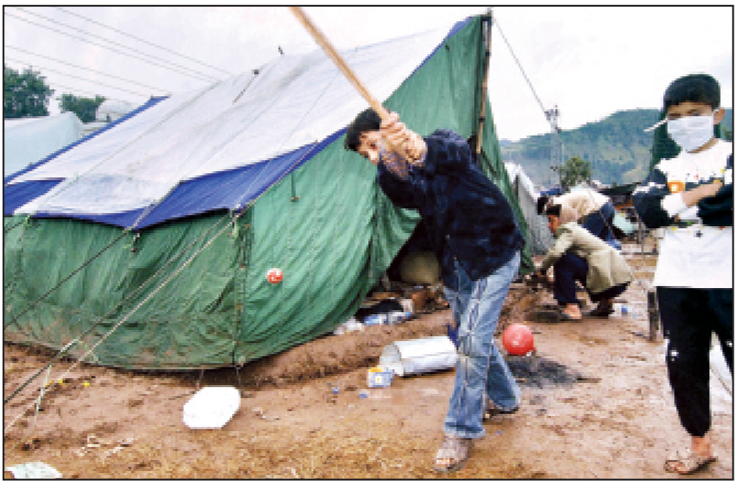
CAN'T TAKE CRICKET AWAY: Children in Muzaffarabad of Pakistan, devastated by last week's earthquake, enjoy some cricket at a refugee camp on Sunday.