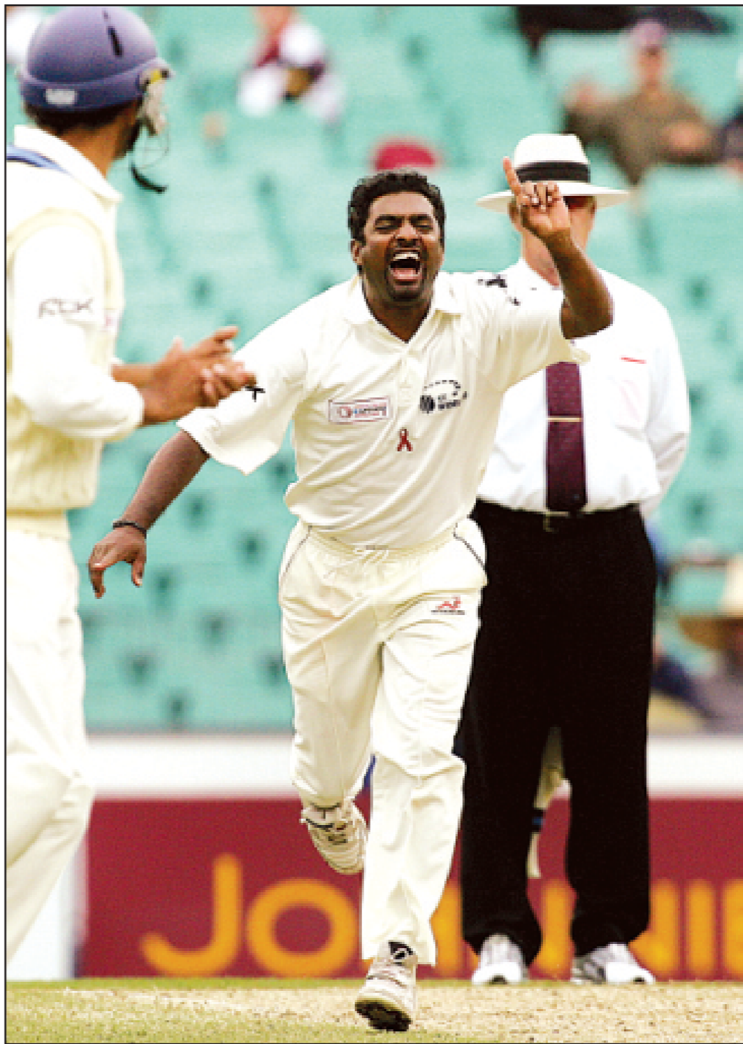
World XI star Muttiah Muralitharan is ecstatic after taking the wicket of Adam Gilchrist of Australia on the third day of the Super Test at Sydney on Sunday.