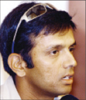
Rahul Dravid (India cricket captain) "It is an honour and a privilege to have been named as captain of India for the next two series."