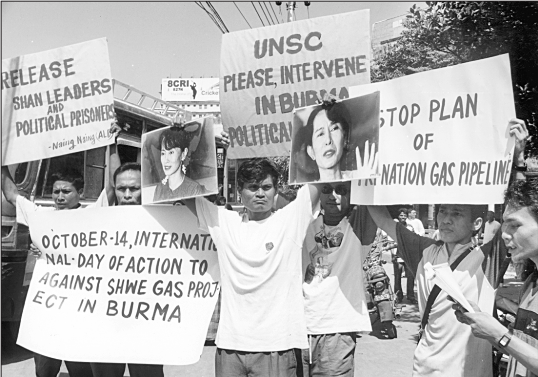
Myanmar citizens residing in Dhaka stage a demonstration at Muktangan in the city yesterday demanding release of their leader Aung San Suu Kyi.