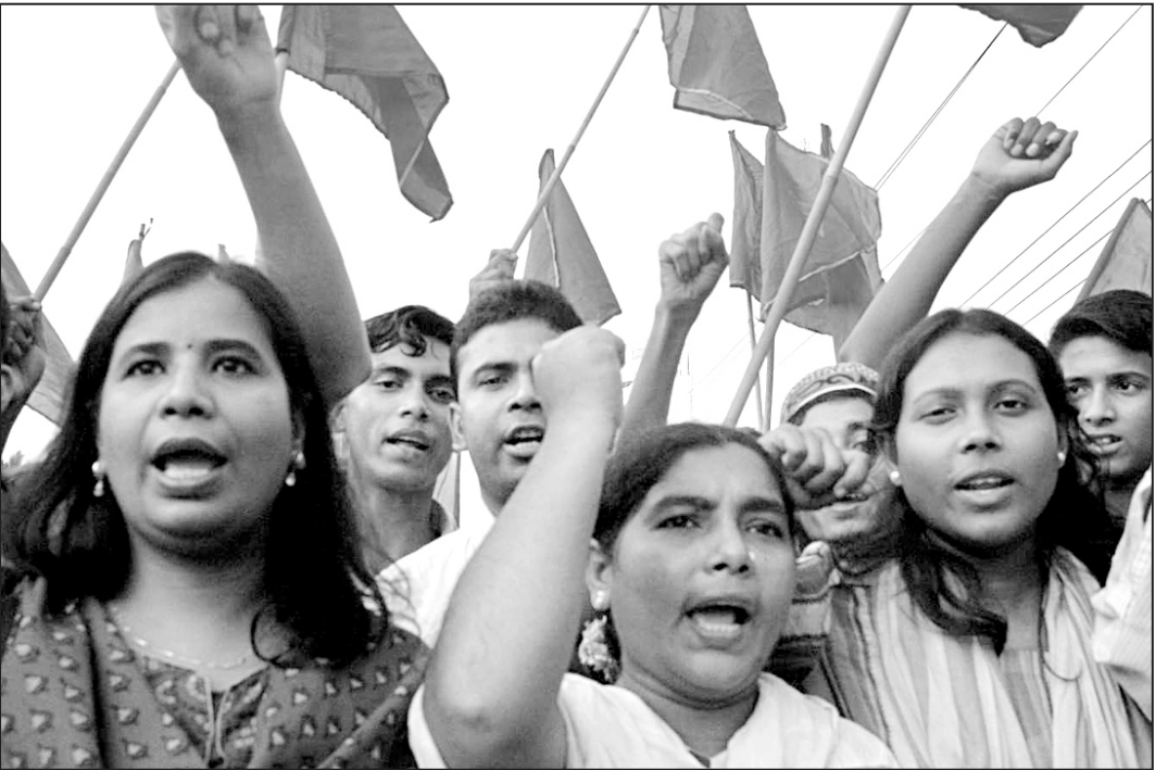
Jatiya Garments-Darji Sramik Karmachari Kendra stages a demonstration at Muktangan in the city yesterday demanding Eid bonus and salary arrears before Ramadan 20.

suffering from eye problems in different forms like partly blindness, blind from birth, total blindness, and cataract. Berdo is helping the sightless people by arranging scholarships, library facilities, training programmes, jobs and credit facilities. Different organisations have taken up programmes to observe the day in a befitting manner. National Forum of Organisations Working with the Disabled will hold a discussion at social service department office at Agargaon in the city at 10.00am.