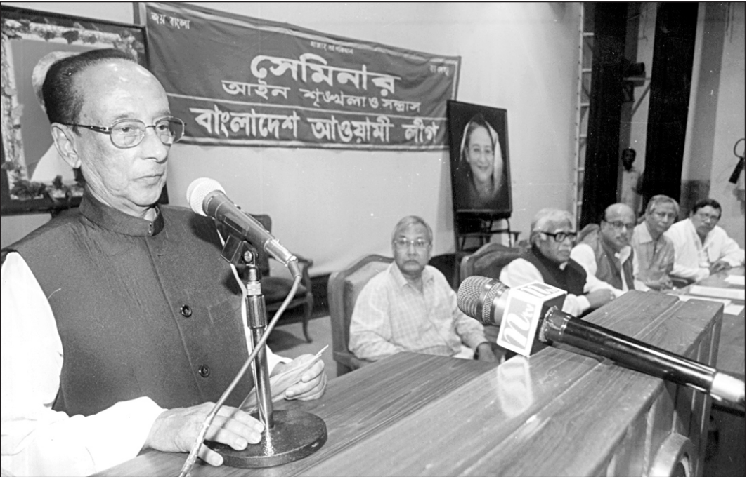
Awami League presidium member Zillur Rahman speaks at a seminar on 'Law and order and terrorism' at the Rajuk Auditorium in the city yesterday. AL organised the seminar.

Monthly meeting of the Lions Club of Dhaka South District 315-B1 will be held. Venue: House-33, Road-4, Dhanmondi. Time: 4.00pm.