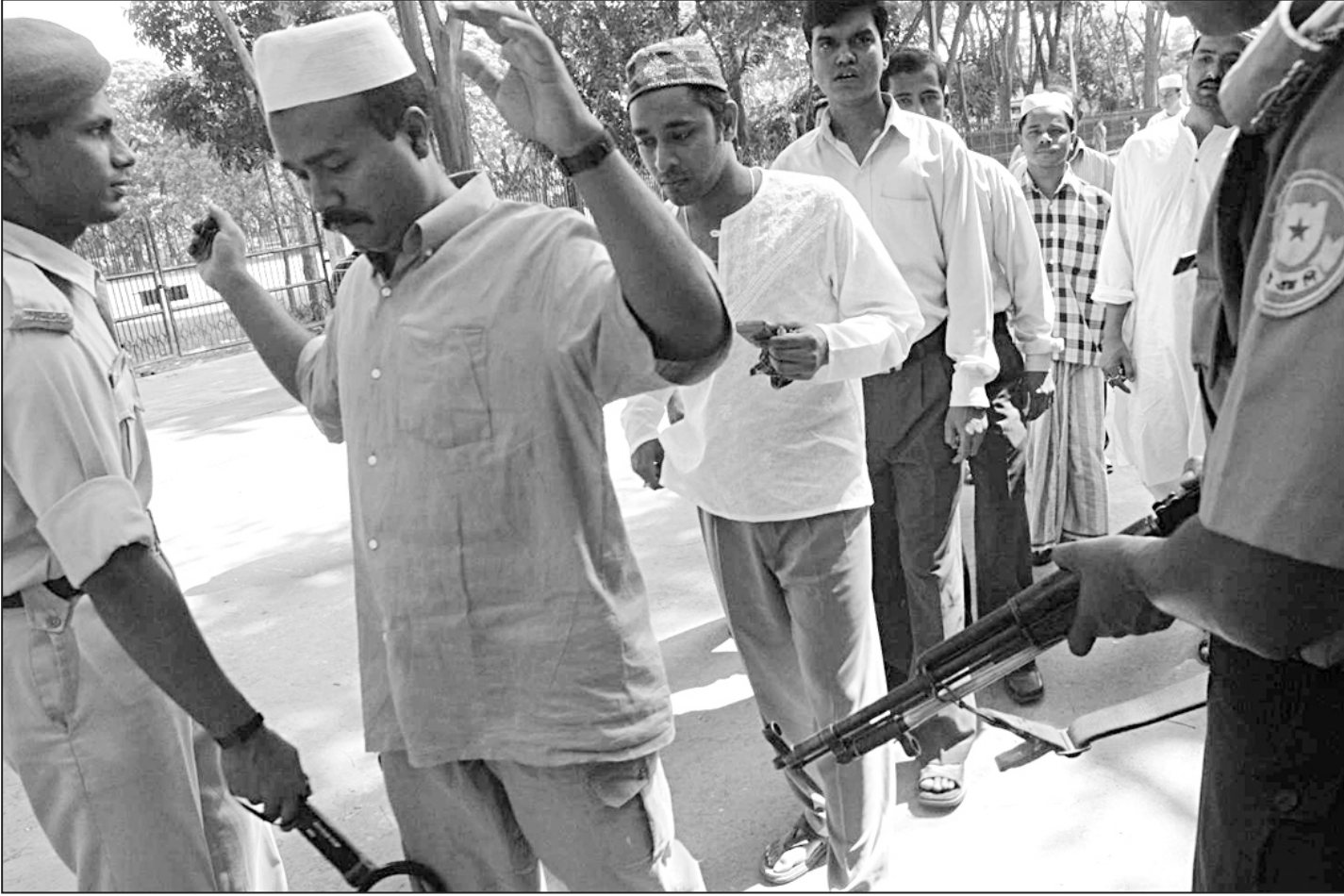
As part of beefed-up security, police search devotees as they enter the High Court Mosque in the city yesterday to offer Juma prayers.