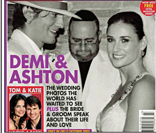
Cover of the OK! magazine

Ashton Kutcher and Demi Moore, who had refused to confirm their September 24 wedding, have opened up their photo album.