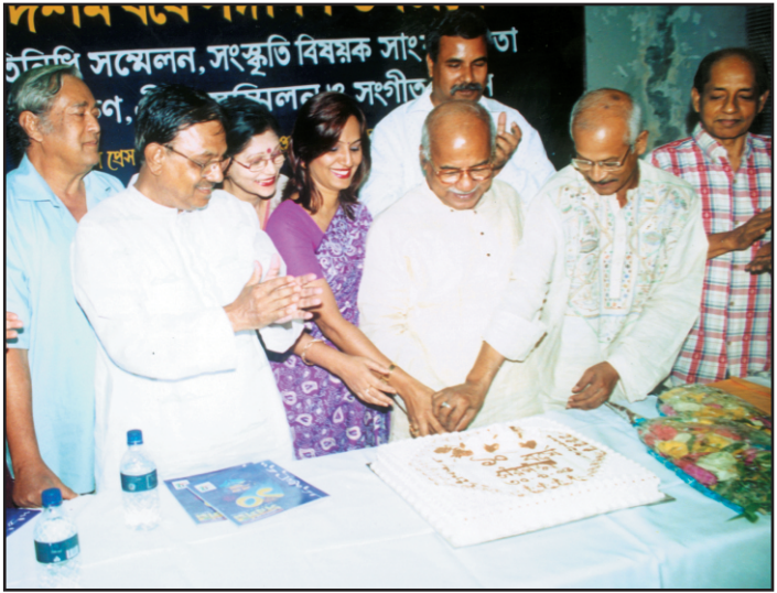
Eminent personalities seen at the event