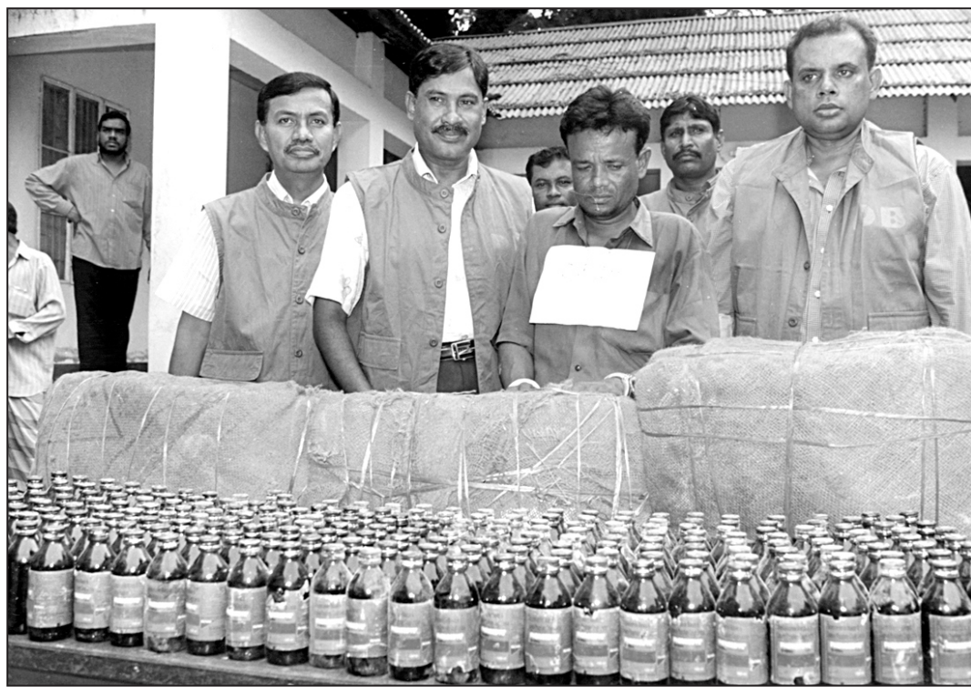
Detective Branch (DB) of Dhaka Metropolitan police recovered 700 bottles of phensidyl from near the Airport police box in the city yesterday.