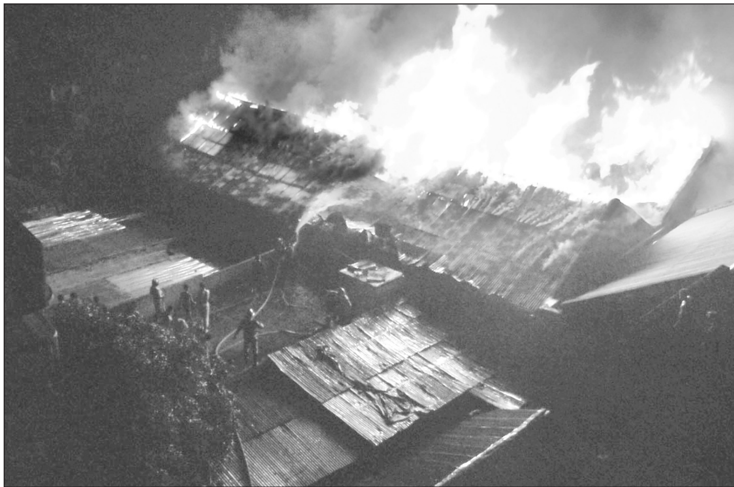
Fire fighters struggle to extinguish a fire that broke out at a godown at East Madarbari in the port city of Chittagong on Wednesday night.

Relatives and admirers have been requested to attend the milad.