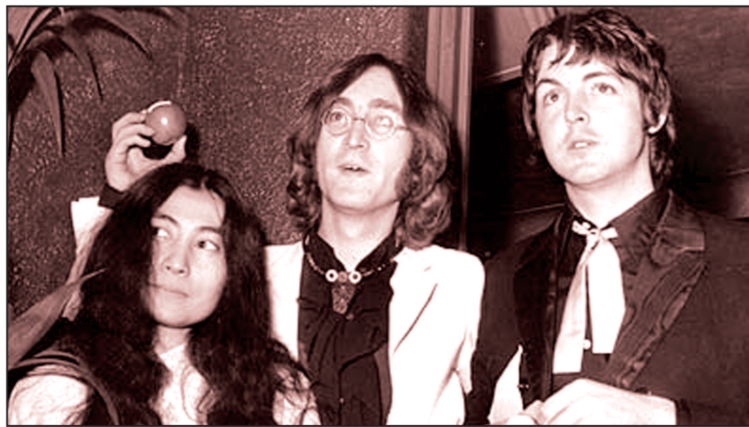
John Lennon (C) with Paul McCartney (R) and Yoko Ono

On October 9, 1940, John Winston Lennon was born into a world he would change within the next 40 years. If he were alive, John Lennon would've turned 65 this year.