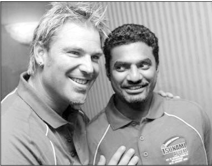
SHANE WARNE (L) AND MUTTIHA MURALITHARAN

"I expect a very, very good showing from these guys," he said. "I think it's going to be a good spectacle, playing the World XI versus the best side in the world."