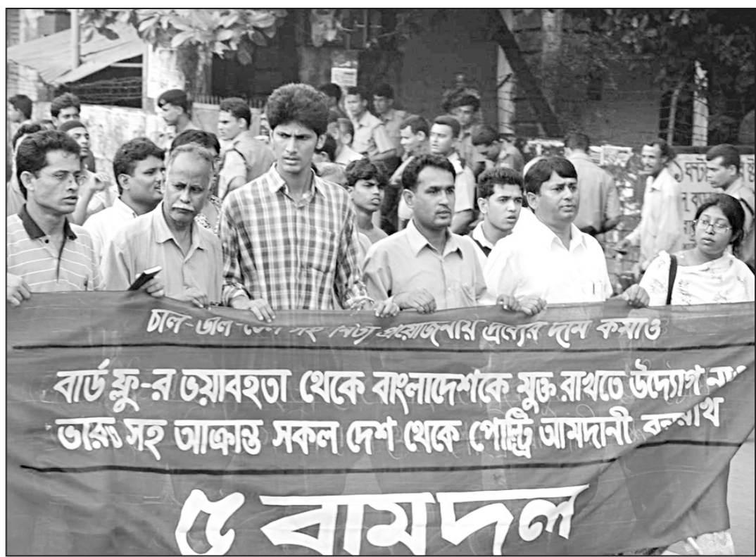
The Five-Left-leaning Party takes out a procession in the city yesterday demanding immediate steps to bring down the prices of essentials and to protect the country from the bird flu, which has struck several Asian nations.