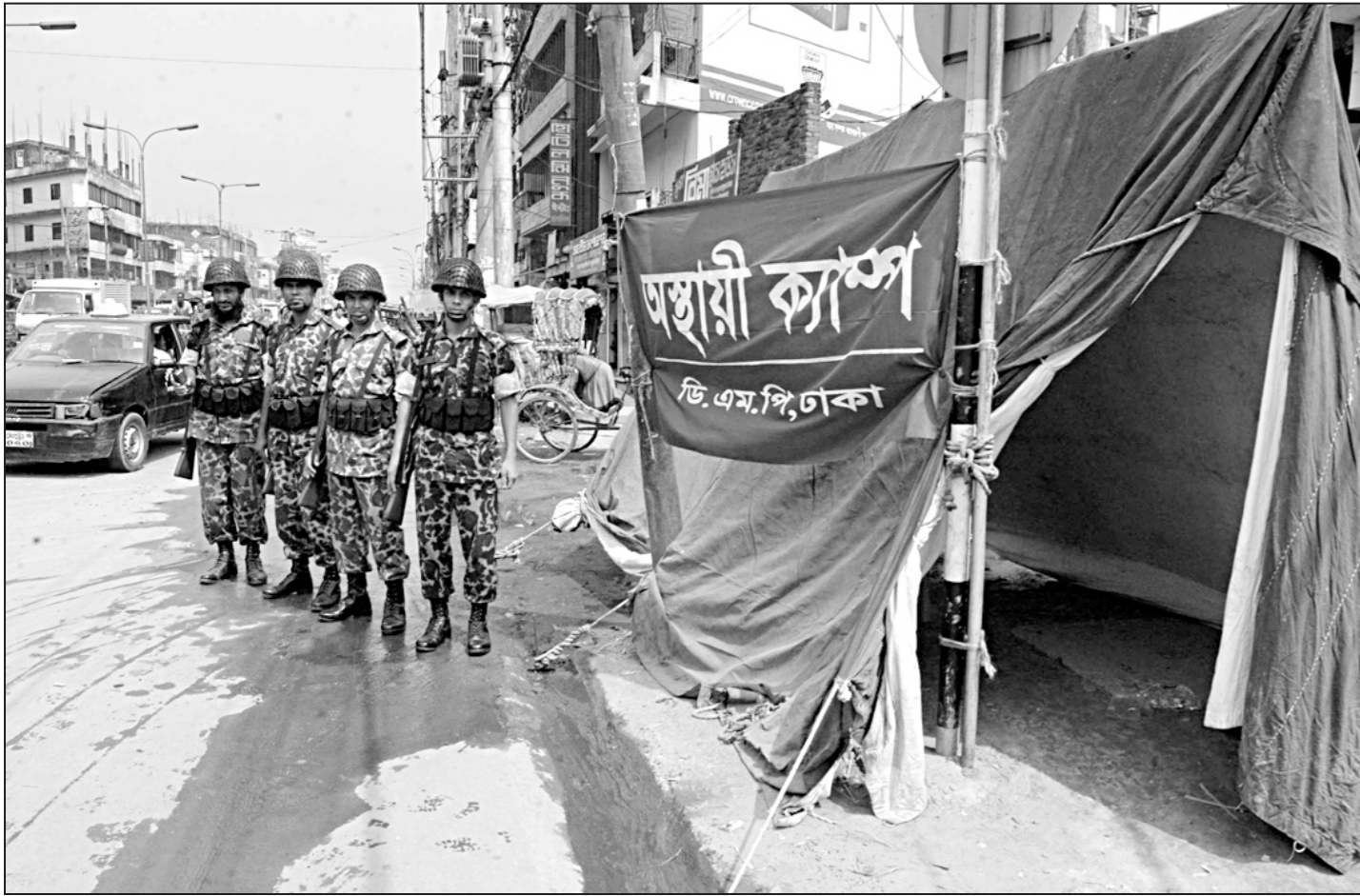
BDR members stand guard near a makeshift camp at Rampura in the city yesterday. The Dhaka Metropolitan Police has set up such camps at different points to beef up security during Ramadan.