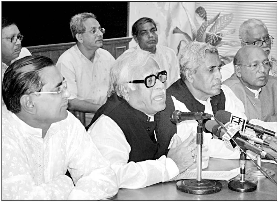
Awami League General Secretary Abdul Jalil speaks at a press conference of 14-party at the National Press Club in the city yesterday.

The Petrobangla chief, however, did not specifically mention when the operation could be resumed. Meanwhile, the Chinese operators have forwarded an insurance claim to the state-owned Sadharan Bima Corporation (SBC) for the damage of its equipment due to the gas leakage. Sources said there is an insurance agreement of a value of Tk 1,200 crore between the SBC and the CMC over the operation of the Barapukuria coal mine.