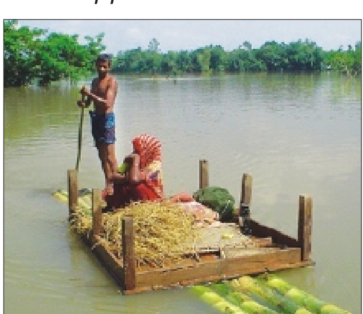
A farmer family in Gaibandha takes their belongings to safety on a raft of banana plants as flooding continues to deteriorate in the district.