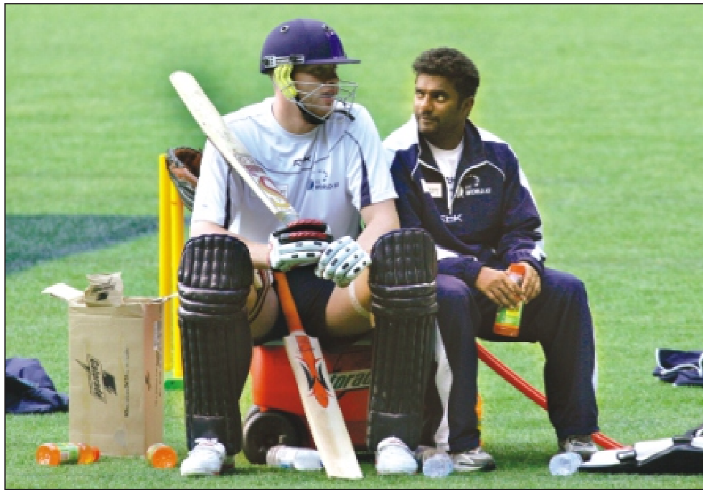
YOU DID YOUR JOB BUT I COULDN'T! England ace Andrew Flintoff chats with spin maestro Muttiah Muralitharan during a training session in Melbourne on Thursday.