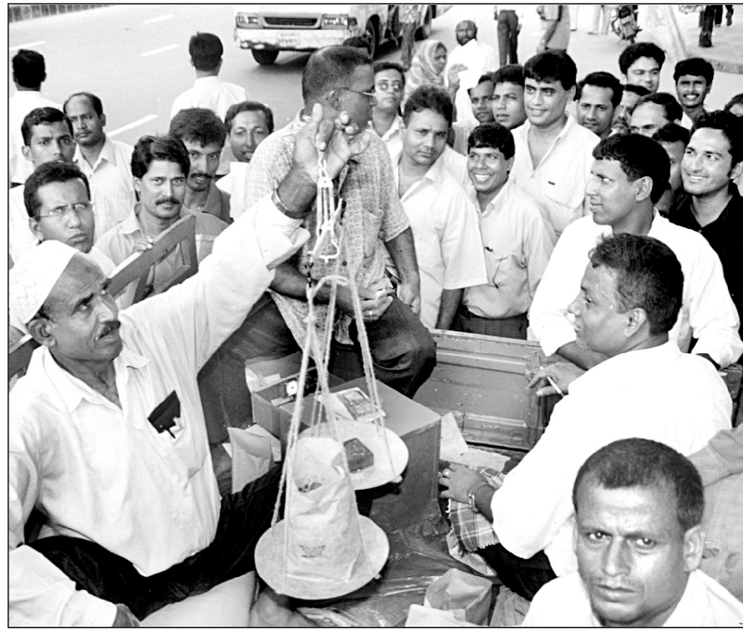
As prices of essentials have skyrocketed in the month of Ramadan, the Trading Corporation of Bangladesh has arranged sale of various essentials such as pulse, gram and sugar at a fair price at different points in the city. This photograph was taken from near the National Press Club yesterday.

The sources said discussions are going on with the Royal Netherlands Embassy in Dhaka, possibly for co-financing in the amount of 4.8 million US dollar but this is not yet confirmed. 4.5 million US dollar will be provided by non-governmental organisations.