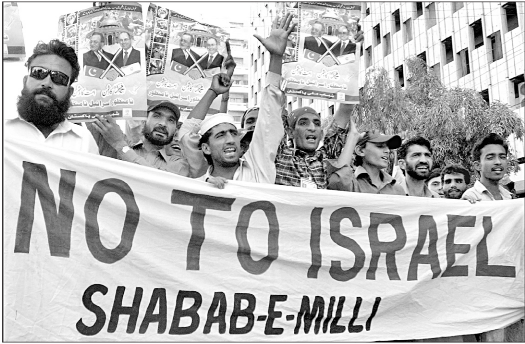
Protest rally in Pakistan.

Letters will only be considered if they carry the writer's full name, address and telephone number (if any). The identity of the writers will be protected. Letters must be limited to 300 words. All letters will be subject to editing.