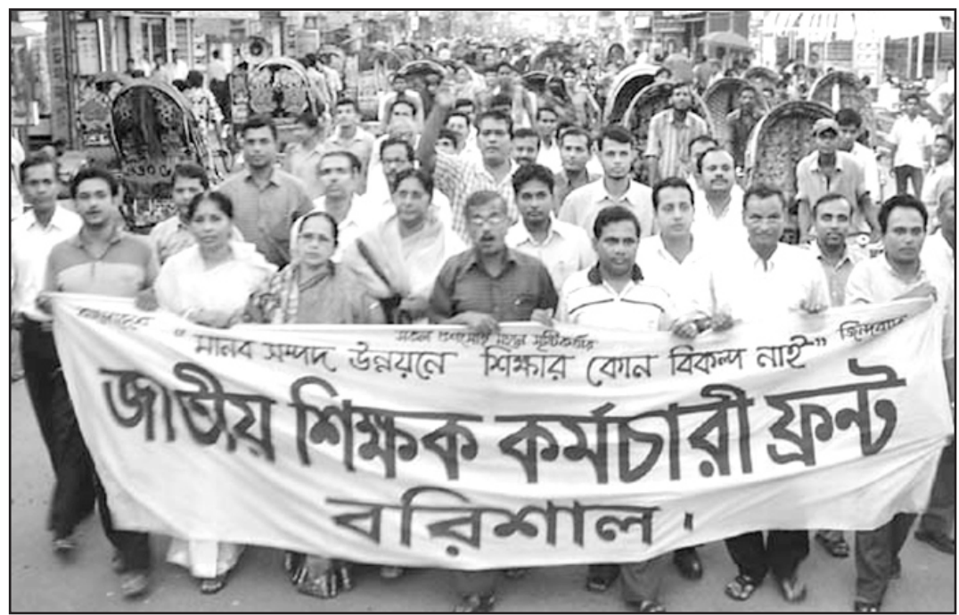
Teachers under the banner of National Teachers Employees Front brought out a procession in Barisal city yesterday demanding increase in salary and other benefits.