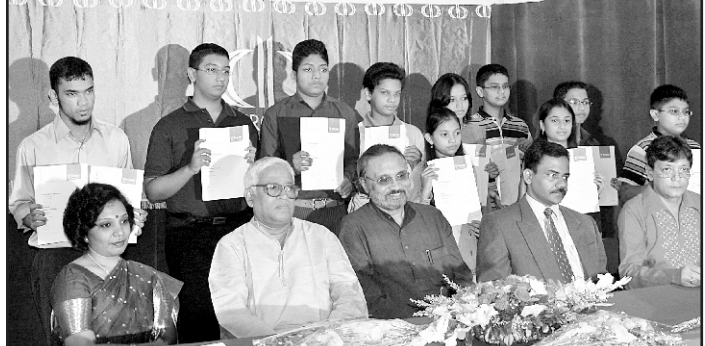
Recipients of the TCL Theory of Music certificates pose with guests at a function in the city yesterday.

Today is the 17th death anniversary of M A Rashid, former secretary of Bangladesh Government, says a press release. Relatives, friends and admirers have been requested to pray for the salvation of the departed soul.