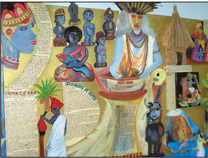
A wall magazine titled, At the Bank of Niger

which was made three dimensionally. The first few chapter of the romance after Gulliver reached the land of Lilliput is presented on the wall magazine. The background of the romance is also mentioned on the magazine by the 32nd batch. The students of the 34th batch worked on the famous pairs found in the