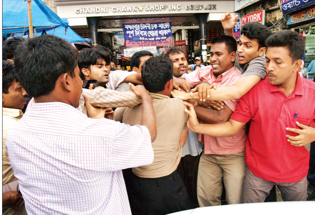
Detective Branch police rushed to Chadni Chawk Shopping Complex (right) as mobs lynch an accused eve teaser (left) in front of the market yesterday. Dhaka Metropolitan Police has decided to beef up security in the market areas ahead of Ramadan.

"During Ramadan we fear increased criminal activities in the city markets. If the government steps up security by deploying more police force, it will have a