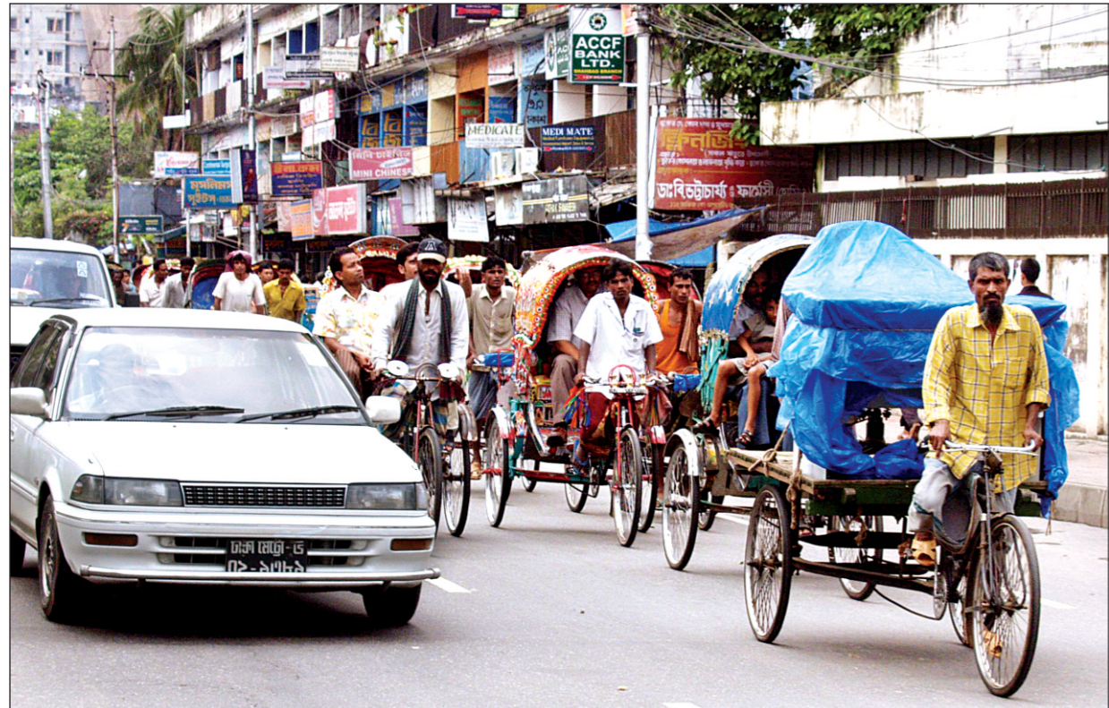
The road stretching from the New Elephant Road to Press Club is likely to be made rickshaw-free before the SAARC summit, which is scheduled for November 12-13.

The eight roads that are waiting to turn rickshaw-free include the Rokeya Sarani (from Mirpur-10 to Farmgate through Taltola, Agargaon), New Eskaton Road to Circular Road (Bangla Motor Moghbazar Mouchak Malibagh Rajarbag), From the Technical intersection to Banani via Mirpur 1 and 2 and Kachukhet, Pagati Sarani (Kuril-Badda-Rampura-Malibagh-Mouchak), Zahir Raihan Road (Azimpur-Fulbaria-Tikatuli-Sayedabad) and North South Road to English road (Malibagh-Kakrail-Purana Paltan-Zero Paltan-Fulbaria-Sadarghat).