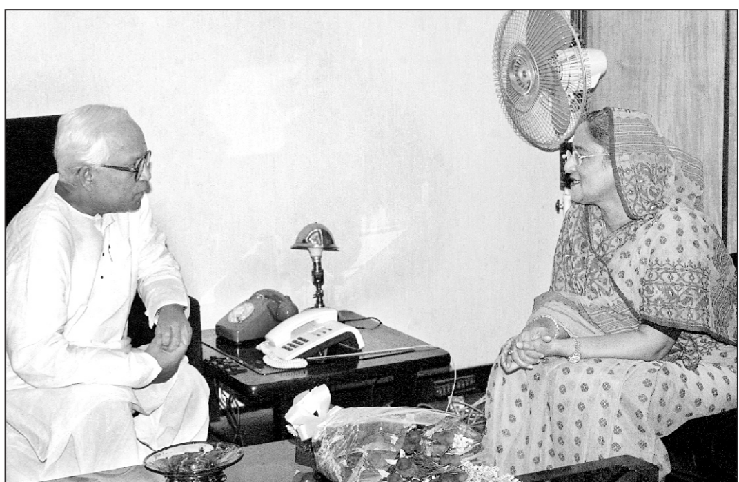
Leader of the Opposition in Parliament Sheikh Hasina calls on West Bengal Chief Minister Buddhadev Bhattacharya in Kolkata yesterday.

She said Bangladesh's successes in non-formal primary education, oral re-hydration, micro-credit programmes, government-NGO collaboration in the field of rural development, poverty alleviation, social mobilisation and empowerment of women have emerged as models for many other countries of the world.