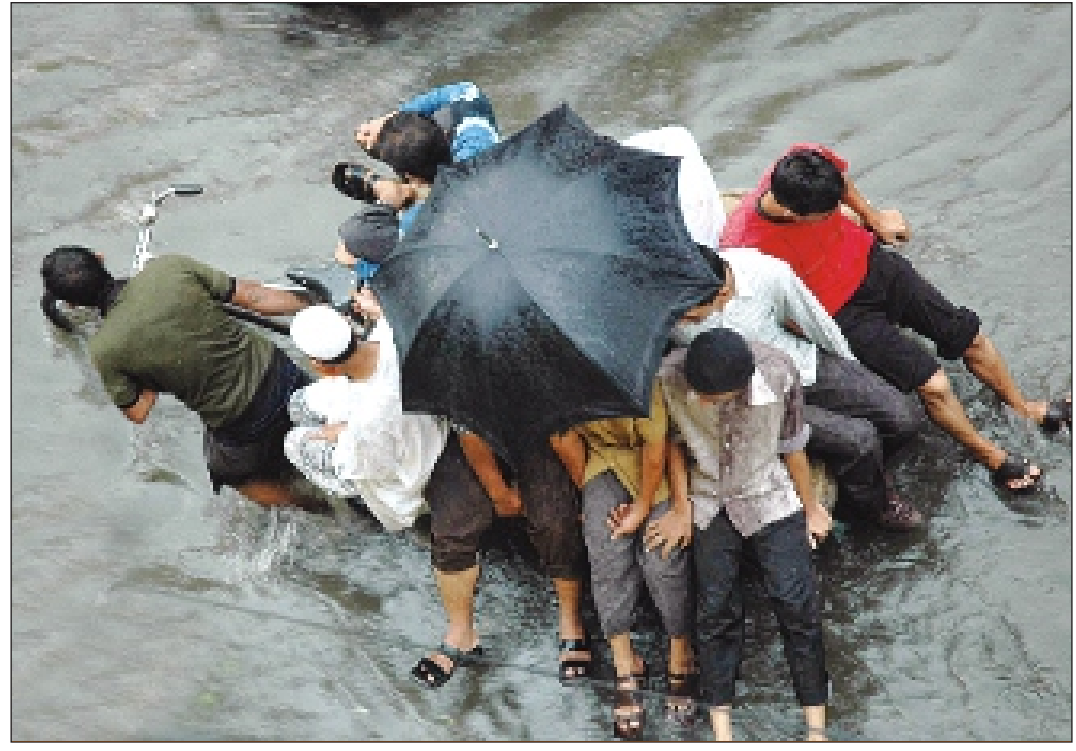
A man struggles with a rickshaw-van crammed with passengers on the waterlogged Nazimuddin Road in the capital during the incessant rain since Friday.

UNB, Dhaka The country's coastal belt may experience "heavy to very heavy" rain today under the influence of a well-marked low over the Bay. The low-lying areas of Bagerhat, Barguna, Bhola, Patuakhali, Barisal, Noakhali, Laxmipur, Feni, Chittagong, Cox's Bazar and their offshore islands and chars area likely to be inundated by wind-driven surges 2-3 feet above normal astronomical tide, said a weather bulletin yesterday. It said the well-marked low over the west-central Bay and the adjoining north-west Bay off Orissa coast persisted over the same area at 3:00pm yesterday. "It is likely to intensify further and move in a northwesterly direction. Squally weather may affect the ports. Sea will remain moderate," said the bulletin. SEE PAGE 15 COL 8