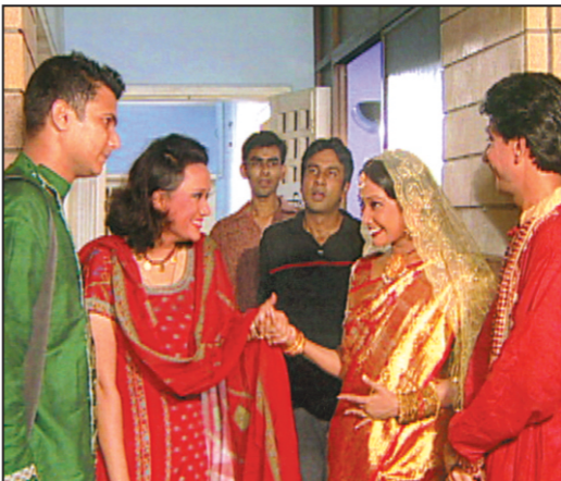
Scences from special TV play i Poribar (L) and Hridoyey Mati O manush