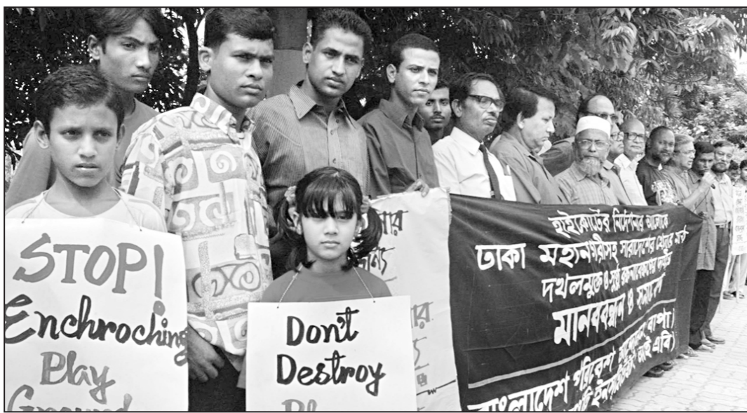
Bangladesh Paribesh Andolon (Bapa) and the Institute of Architects, Bangladesh (IAB) form a human chain at Dhanmondi in the city yesterday demanding that encroachers be evicted from all playgrounds across the country.