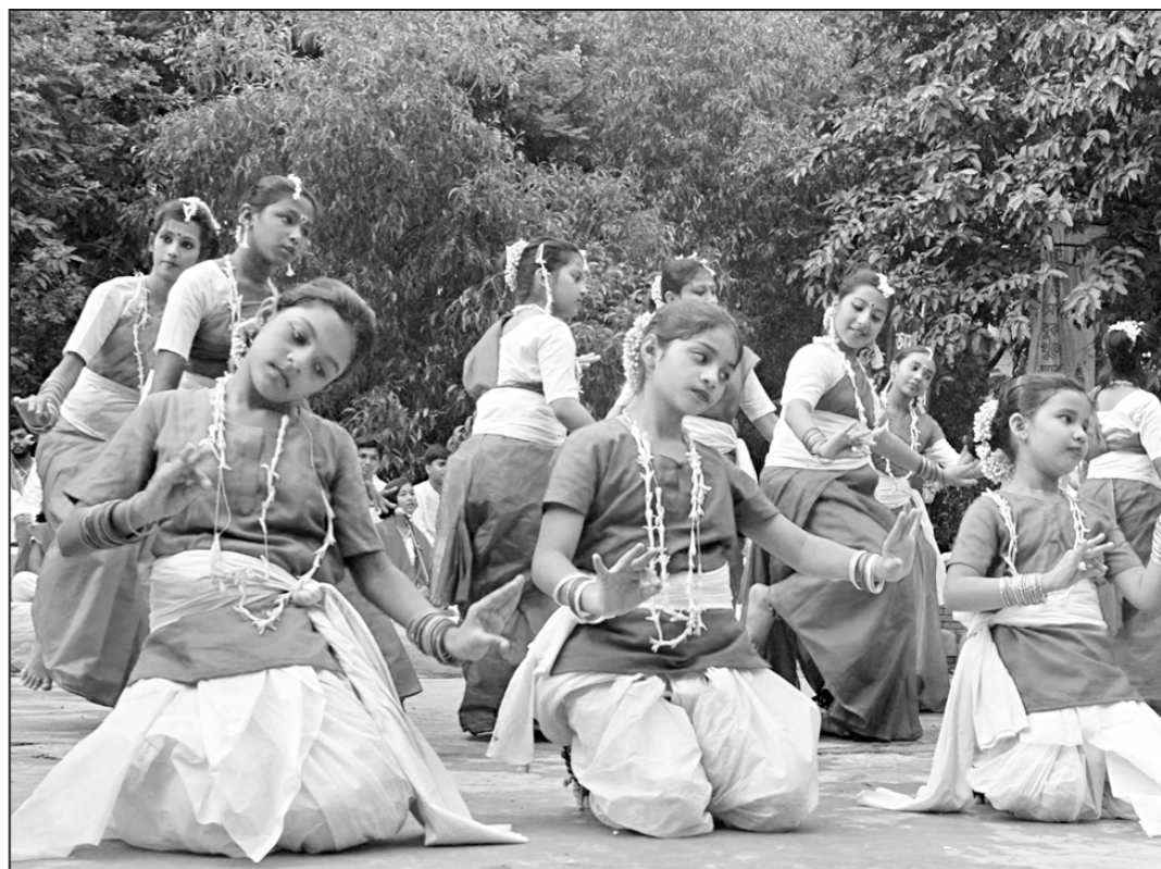
Child artistes of Chayanaut perform at a function in celebration of autumn festival at Dhanmondi in the city yesterday.

They urged the government to take measures to stop the move to shift the temple in the greater interest of the Hindus. They also called upon the Prime Minister and the authorities concerned to retrieve the grabbed property.